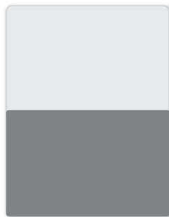
1/2 page 190 x 120 mm (+ 3-5 mm bleed)